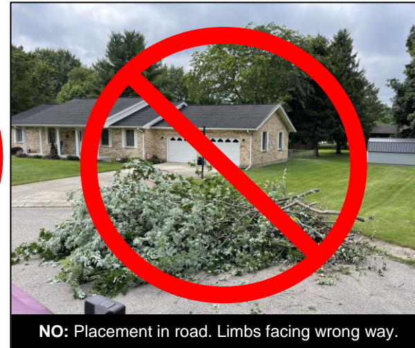
NO: Placement in road. Limbs facing wrong way.

“Brush collection typically begins the middle of April and ends late September.”