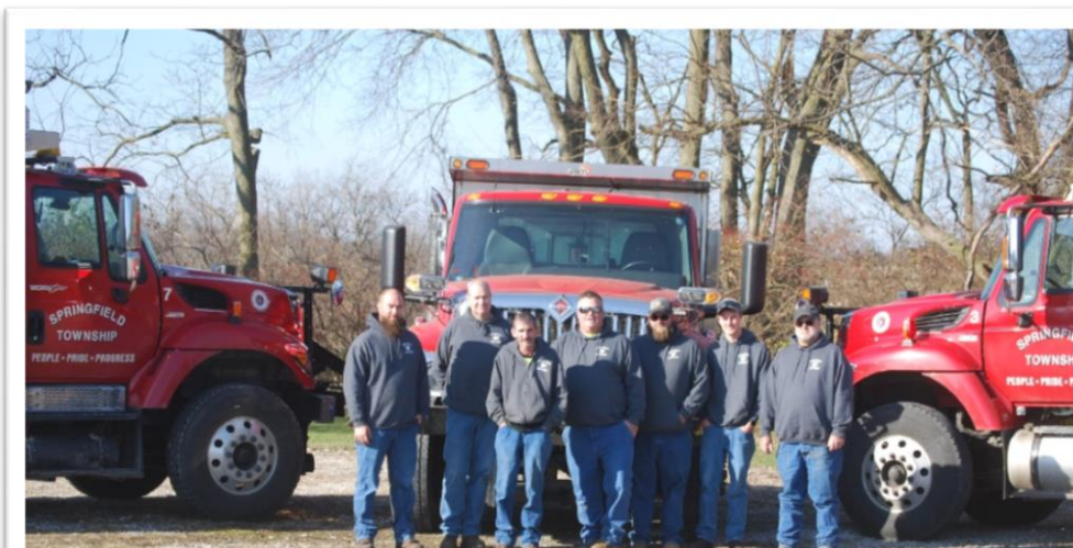
Springfield Township Road Crew

Road resurfacing is determined by pavement condition. Roads are constantly being evaluated and ranked for repairs based on condition.