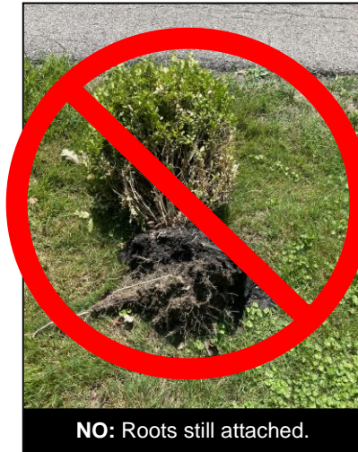
NO: Roots still attached.